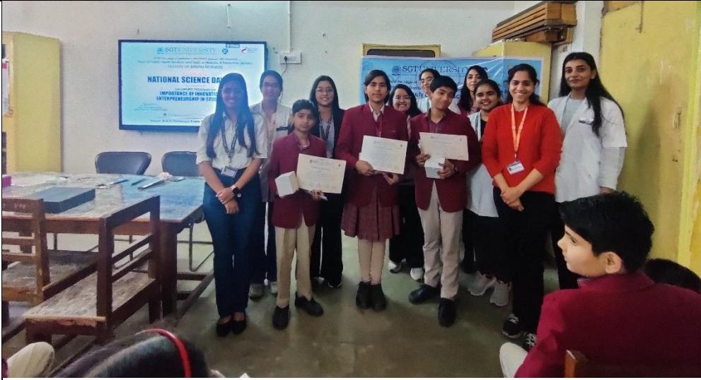
Prize distribution through certificates and gift hampers among quiz competition winners.